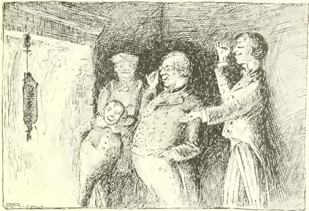
YE PIG TWIRLETII.